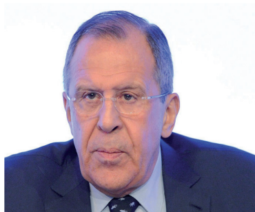
SERGEY LAVROV Minister of Foreign Affairs, Russia