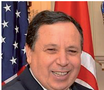
KHEMAIES JHINAUI Minister of Foreign Affairs, Tunisia