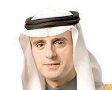
ADEL AL-JUBEIR Minister of Foreign Affairs, Saudi Arabia