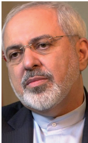
MOHAMMED JAVAD ZARIF Minister of Foreign Affairs, Iran