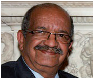
ABDELKADER MESSAHEL Minister of Foreign Affairs, Algeria