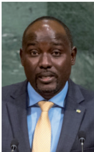
IBRAHIM YACOUBOU Minister of Foreign Affairs, Niger