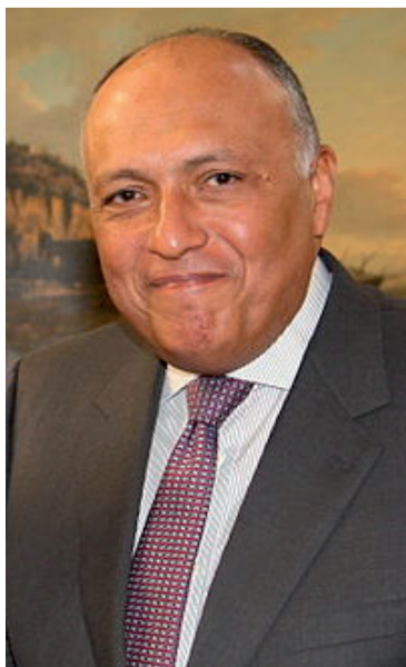
SAMEH HASSAN SHOUKRY Minister of Foreign Affairs, Egypt