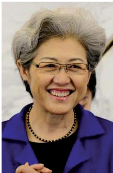
YING FU Chairperson of the Foreign Affairs Committee, National People's Congress, China